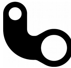
Holder kit 90° Art. No. 1201 32.2 x 30 mm