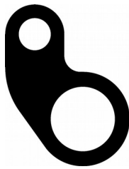
Holder kit 45° Art. No. 1200 23.2 x 30 mm